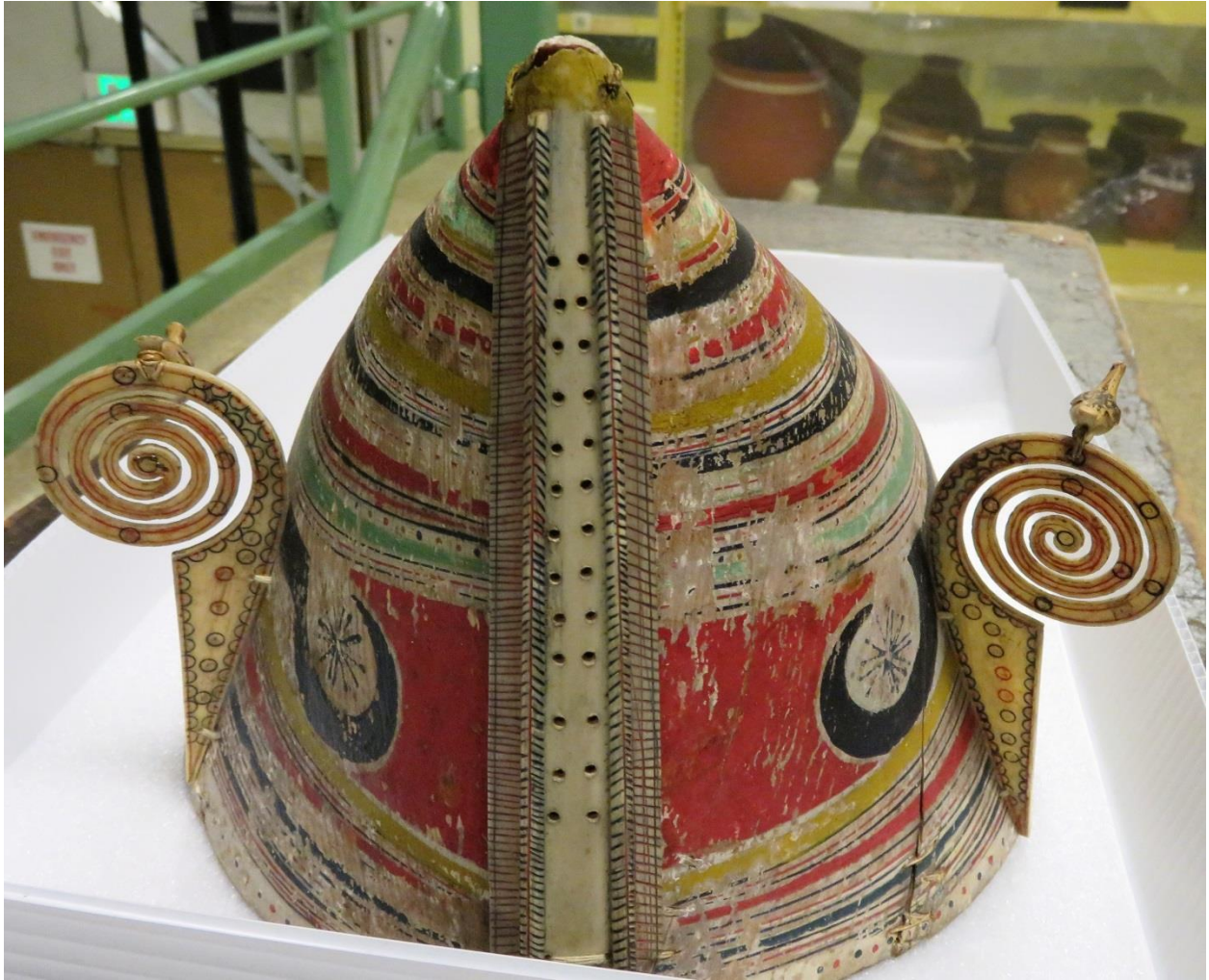
Hunting hat located in UC Berkeley, Photo courtesy of Barclay Kopchak