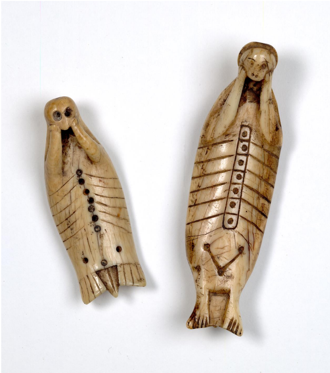
Carved hunting amulets of seals, photo courtesy of Dr. Crowell, Smithsonian Arctic Studies