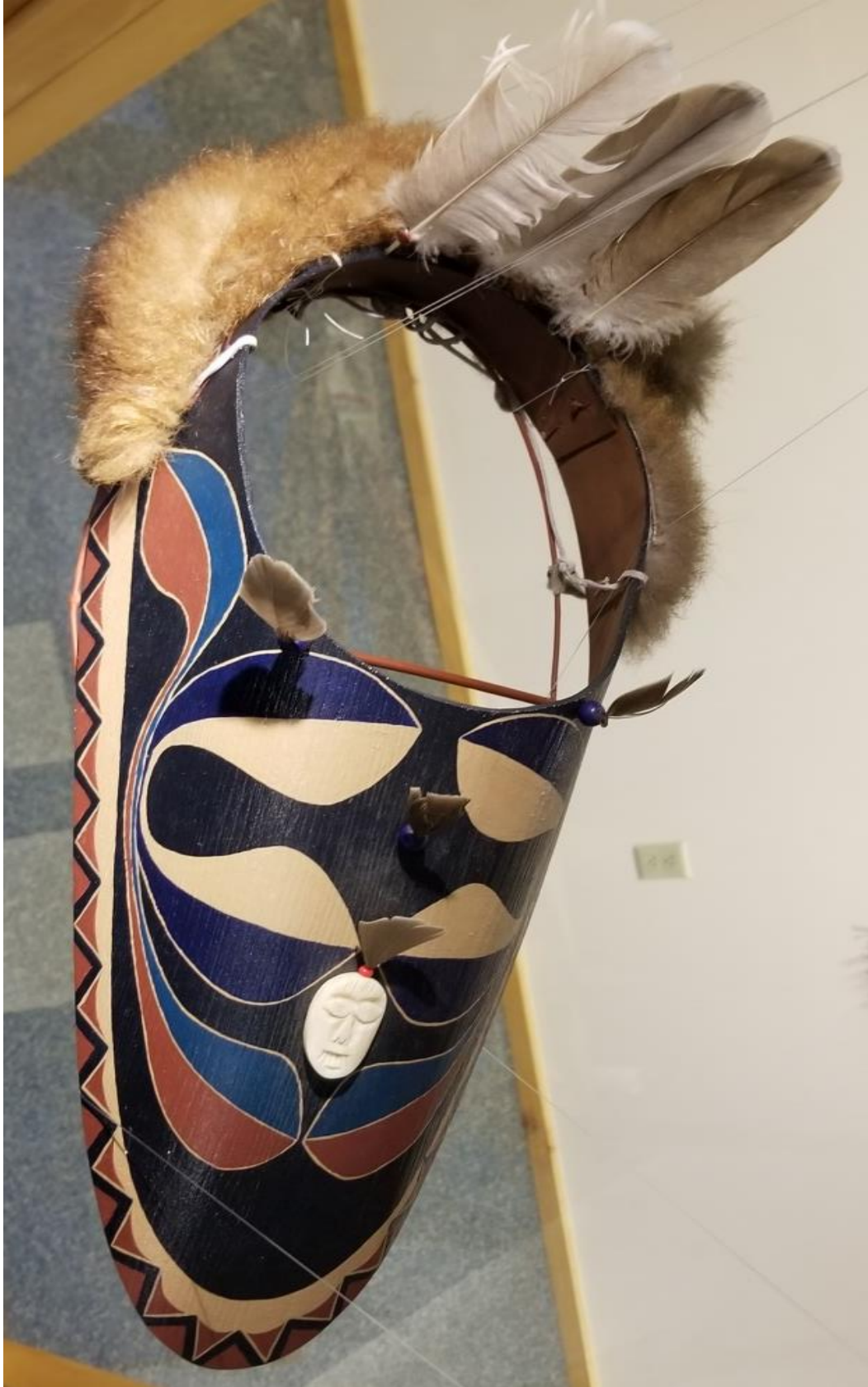
Visor located in Native Village of Eyak Ilanka Center.