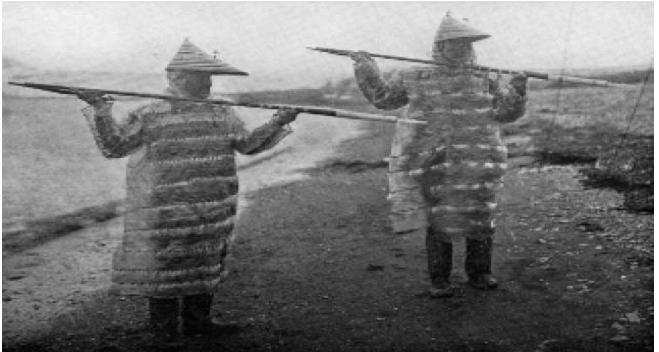
Traditional Seal Gut Raingear, Hunting Visors, Spears