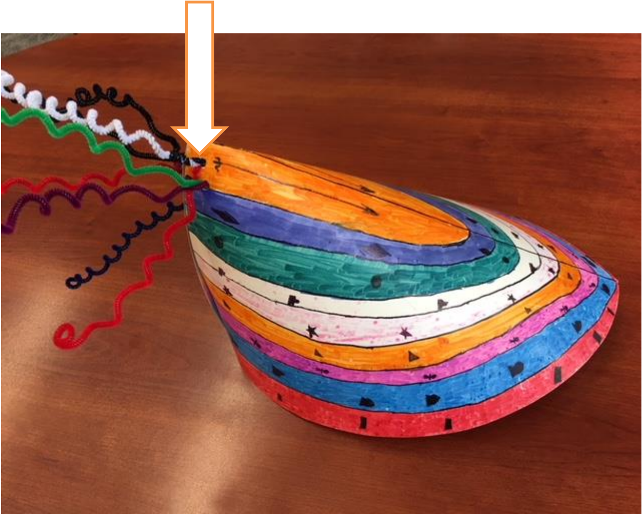
Finished Seal Hunting Hat

Put the pipe cleaners/ feathers through the punched out holes.