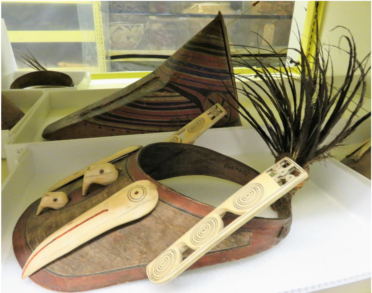
Visors located in UC Berkeley