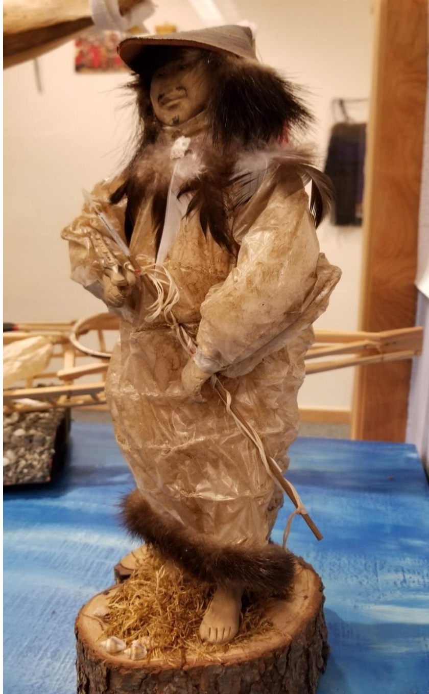
A traditional hunter doll wearing the hunting hat. The long bill covered the hunter's eyes, which prevented glare for the water and protected the hunter's eyes from the water spray.