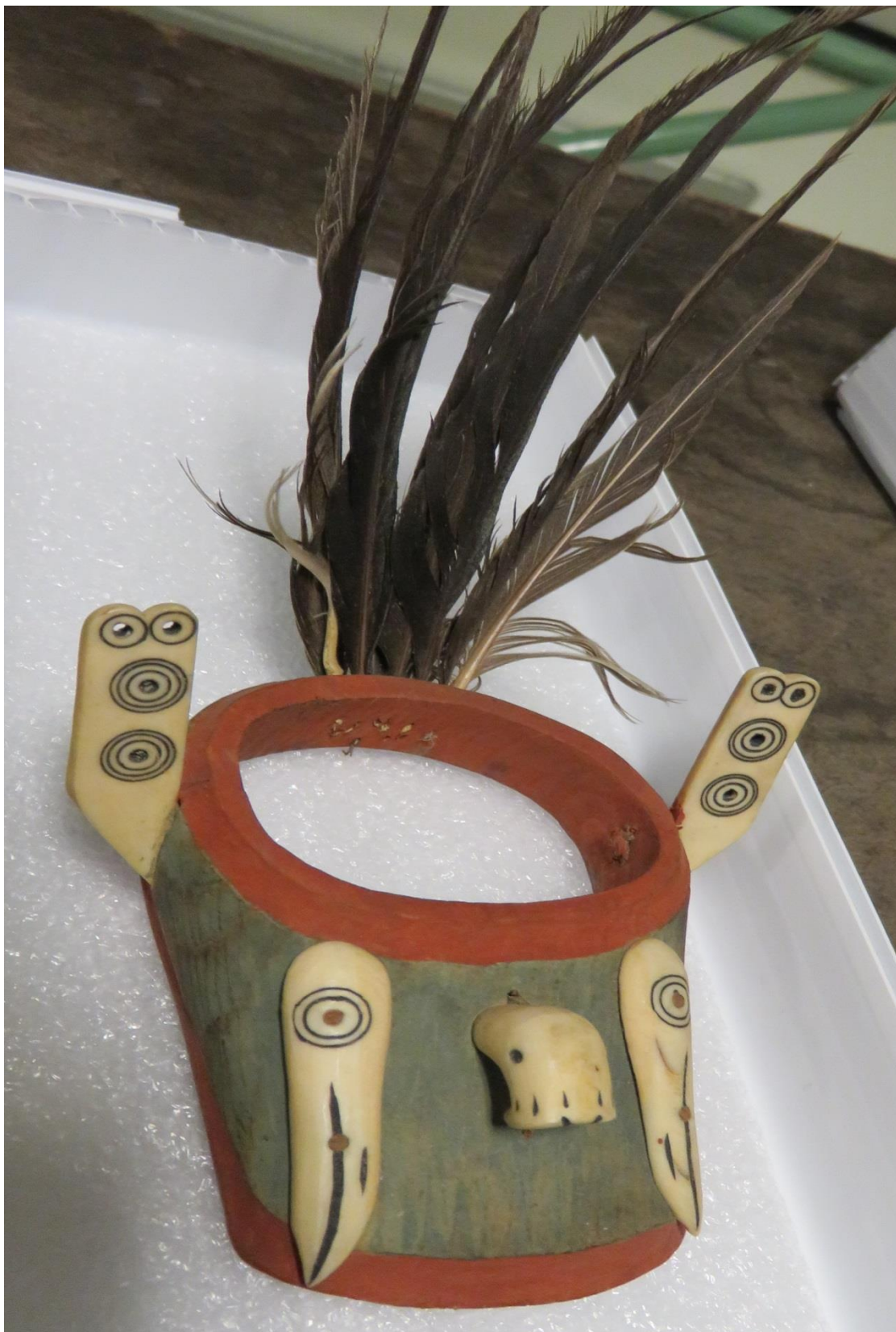
Visors located in UC Berkeley