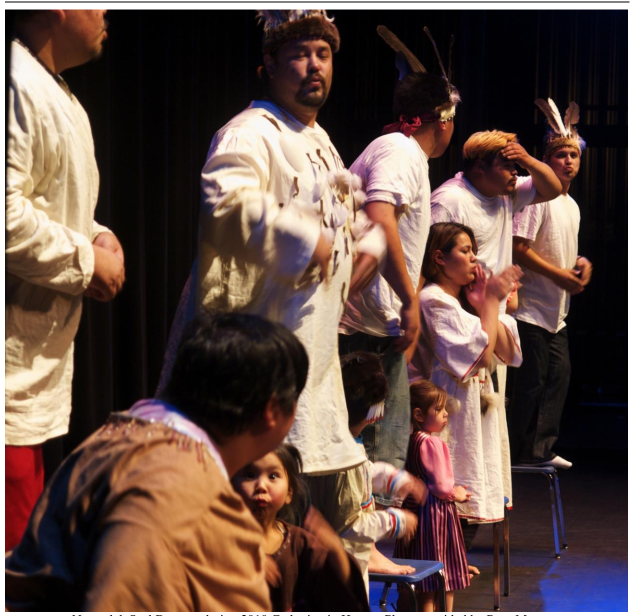
Nanwalek Seal Dancers during 2010 Gathering in Homer