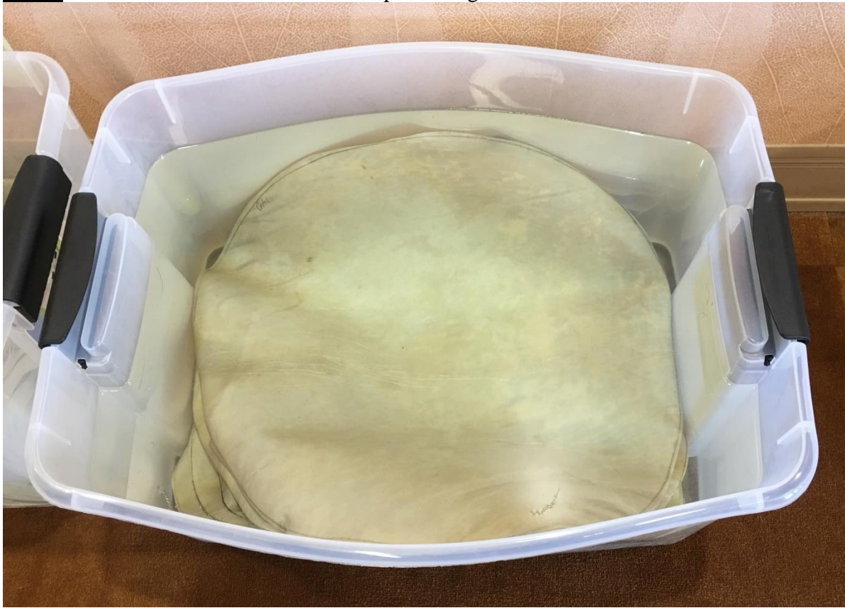
Rawhides soaking in water

Step 1: Soak the rawhide and rawhide strips overnight in water before lesson.