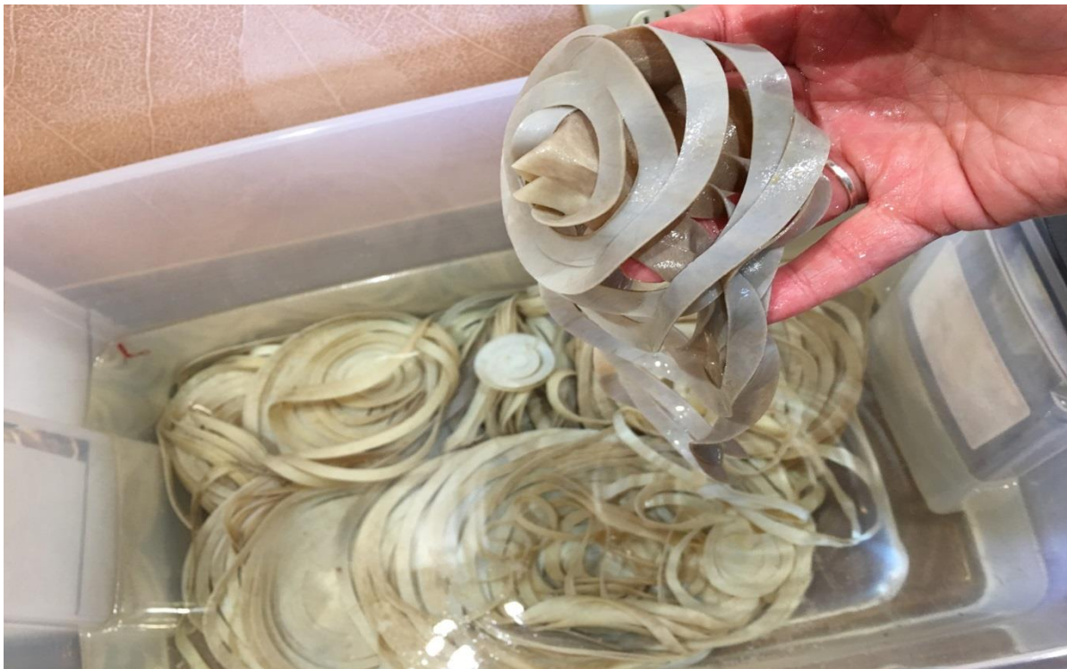
Rawhide lacing soaking in water