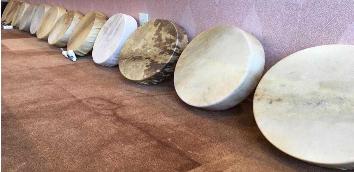
Drums made by the ladies during the Chugachmiut's Women's Healing Retreat

Step 10: Allow drum to dry overnight in a cool place. It is very important NOT to beat on the drum before it dries thoroughly!