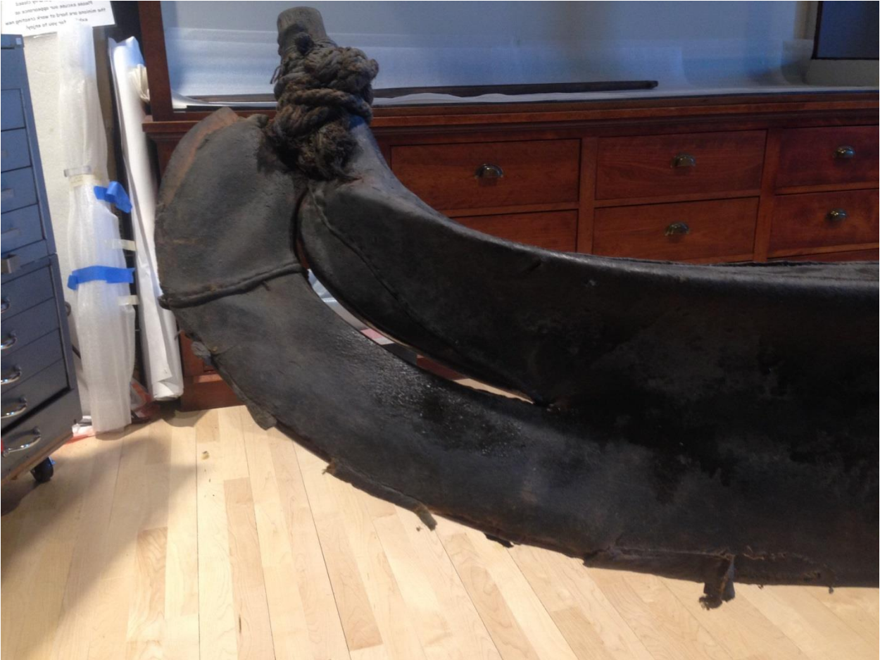
Actual Seal Skin Covered Bifurcated Bow from Traditional Qayaq located in Cordova Historical Museum