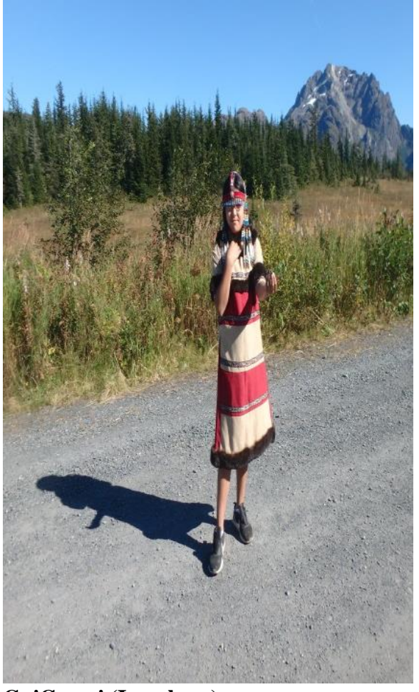
GuiGwani (I am here) Switch, extend the other hand out and other hand to chest.