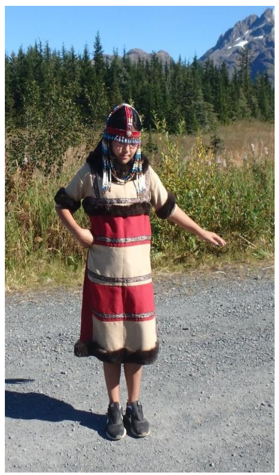
Ikani (Over there) Qikitaq (Bashful) -do 2 times Motion your left arm out two times