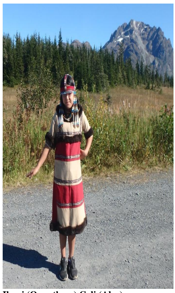
Ikani (Over there) Cali (Also) Guangkuta (All of us) -do 2 times Motion your right arm out two times