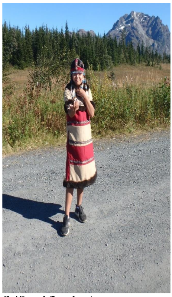
GuiGwani (I am here) Extend one hand out and keep other hand to chest.